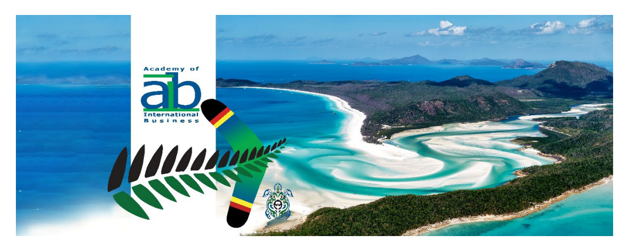
The Academy of International Business Oceania Chapter, invites you to: